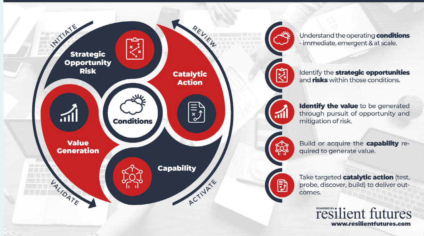
Diagram as used in leadership retreat for the National Australia Bank

A continuous cycle of change through the five elements, in any period of time (day, week, month), to create strategy that allows a timely response to changing conditions and underpins a strategic approach to leveraging disruption.